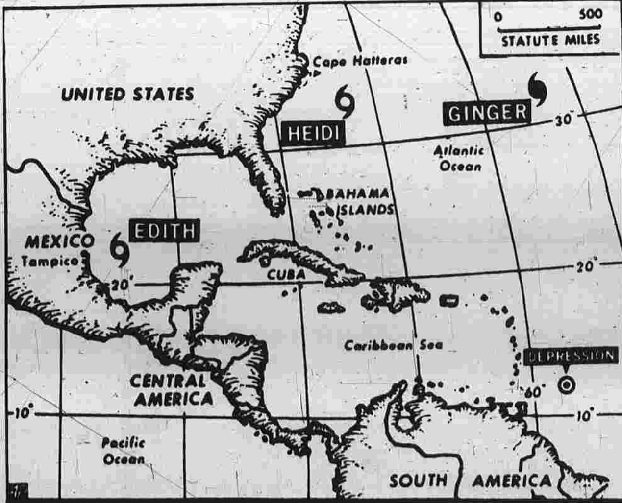
Map locates tropical storm Edith drifting in the Gulf of Mexico and Heidi moving up the Atlantic coastline. Hurricane Ginger slashed a path that endangered shipping east of Bermuda.

MIAMI, Fla. (AP) — Tropical storm Heidi barreled up the Atlantic coastline today, threatening the Northeast with more heavy rains, while her older sister Edith drifted on a course that would take it into Mexico. As the remains of tropical storm Fern broke up in the mountains of Mexico, a new tropical depression headed in the direction of Barbados some 2,000 miles southeast of Miami. Edith, which killed 23 persons in Nicaragua and Honduras when it carried hurricane force winds into the two Central American countries last Thursday, has been downgraded to a tropical storm with peak winds of 45 m.p.h. But the National Hurricane Center in Miami predicted Edith would gradually strengthen with the storm center crossing the northeast coast of Mexico tonight. Her coordinates early today were latitude 23.3 north, longitude 94.8 west, or about 200 miles east of Tampico, Mexico. Other storms kicking up trouble were: Heidi — A tropical storm with peak winds of 50 m.p.h., her position at 6 a.m. EDT today was near latitude 33.5 north, longitude 72.5 west, or about 215 miles west of Cape Hatteras, N.C., and heading northward, at about 15 m.p.h. Forecasters said her speed was ex- (See Page Twelve)