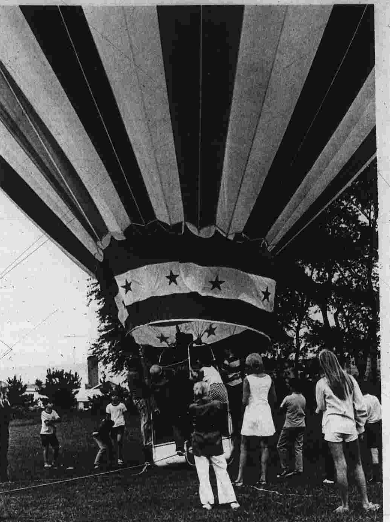
Up, Up and Away Balloon rides proved to be a popular feature at the Wapping Fair on Saturday. The balloon was provided by Ralph Hall of Lexington, Mass., and was tethered so it wouldn't float too high.

(Continued from Page One) The dollar opened a new week of trading on the world exchange today to mixed reaction.