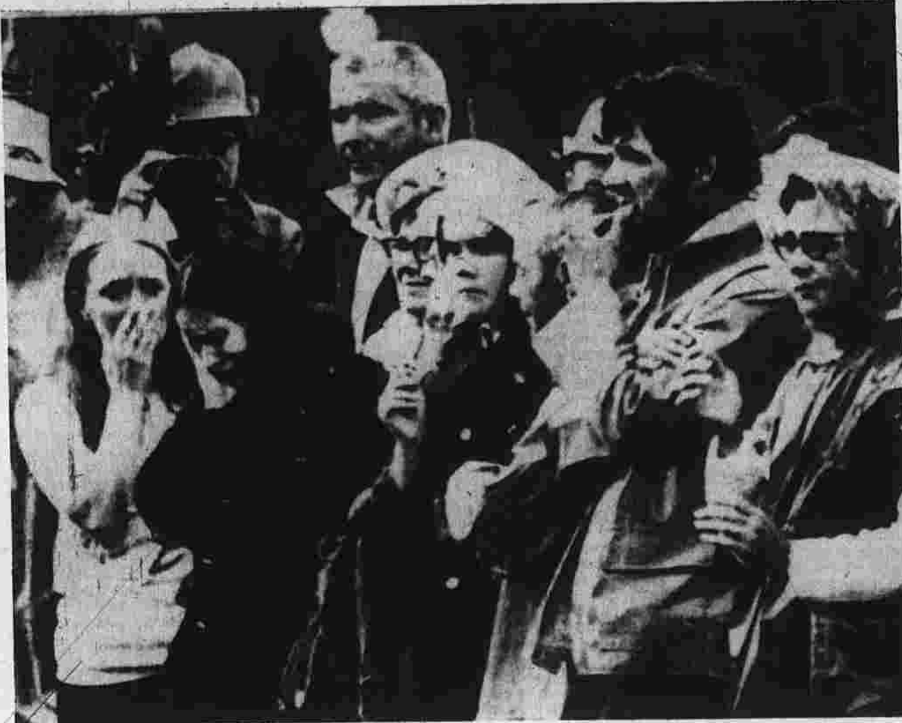
Relatives of hostages display their feelings this morning outside Attica State Prison.