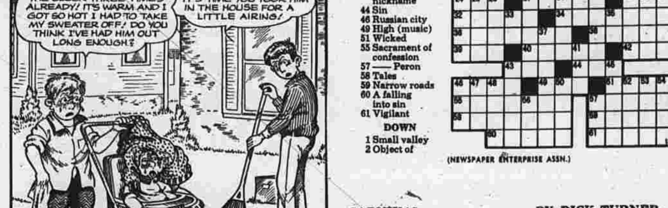
BY AL VERMEER